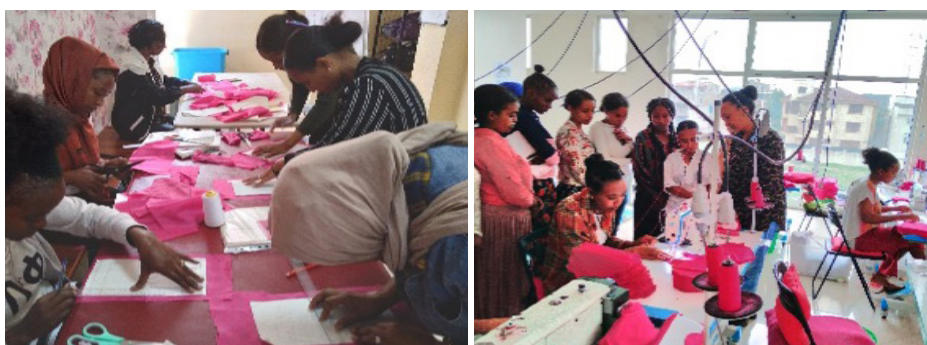
Fig. 1 and 2

The Business Hub currently coordinates, implements and supports several projects with the private sector, incl. 15 development partnerships with the private sector in close cooperation with projects and programmes. The development partnerships have a total volume of approx. 40 Million Euros, of which more than half (65%) come from funds of private sector partners.